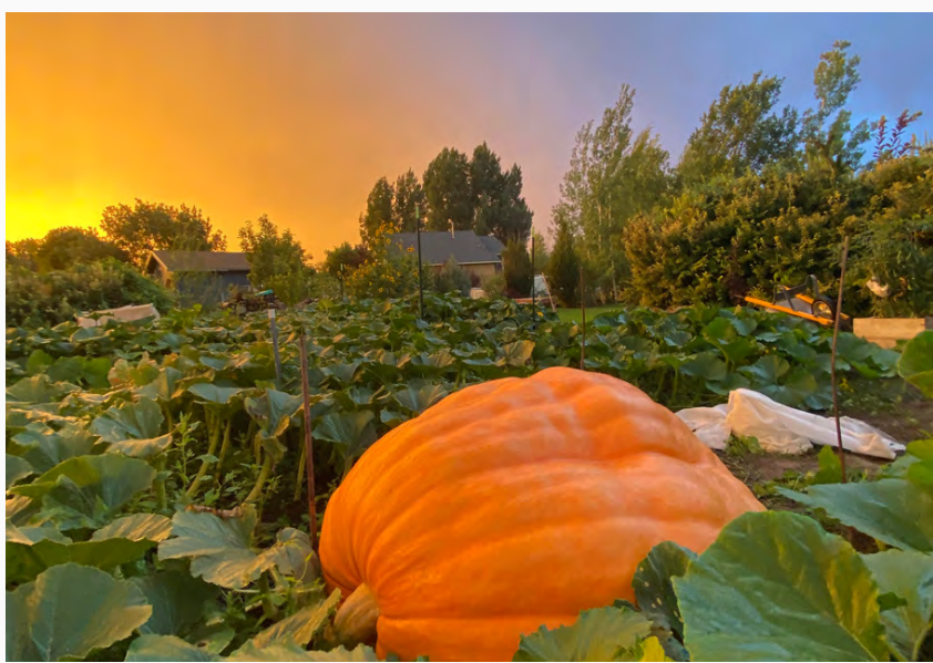
THIS IMAGE IS NOT AI GENERATED - ED.

Are you excited for 2024? Let's make some plans! The seed auction is set for February 23rd in the bigpumpkins.com chat room. You are the key to a great auction. Club members who bid are a great help to an exciting auction while raising funds for club events. Speaking of club events, don't miss the spring meeting, 10am March 23rd at Mountain Valley Seed, 175 W 2700 S Salt Lake.