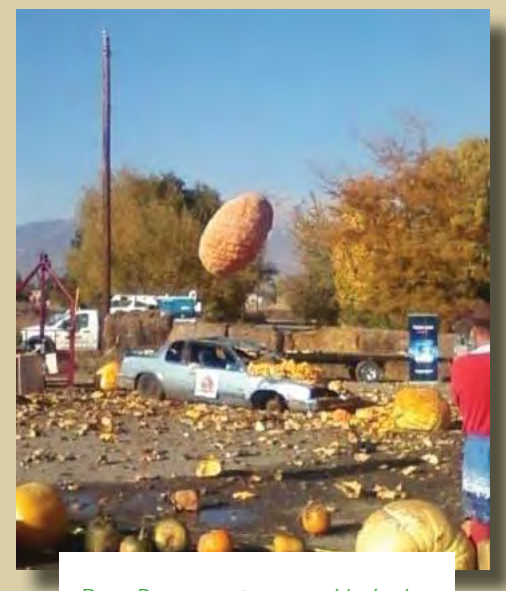
Ross Bowman's pumpkin being dropped on car