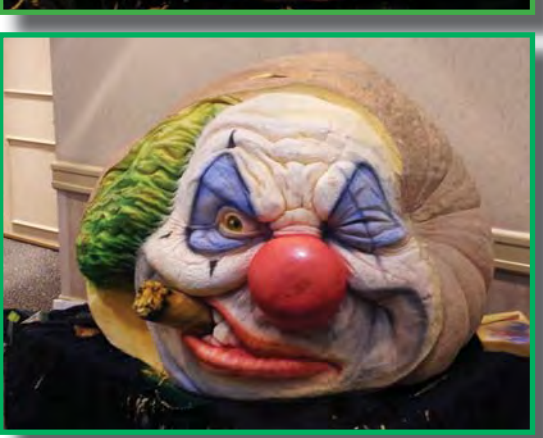
Wow! Who knew that a clown was hiding in that pumpkin!